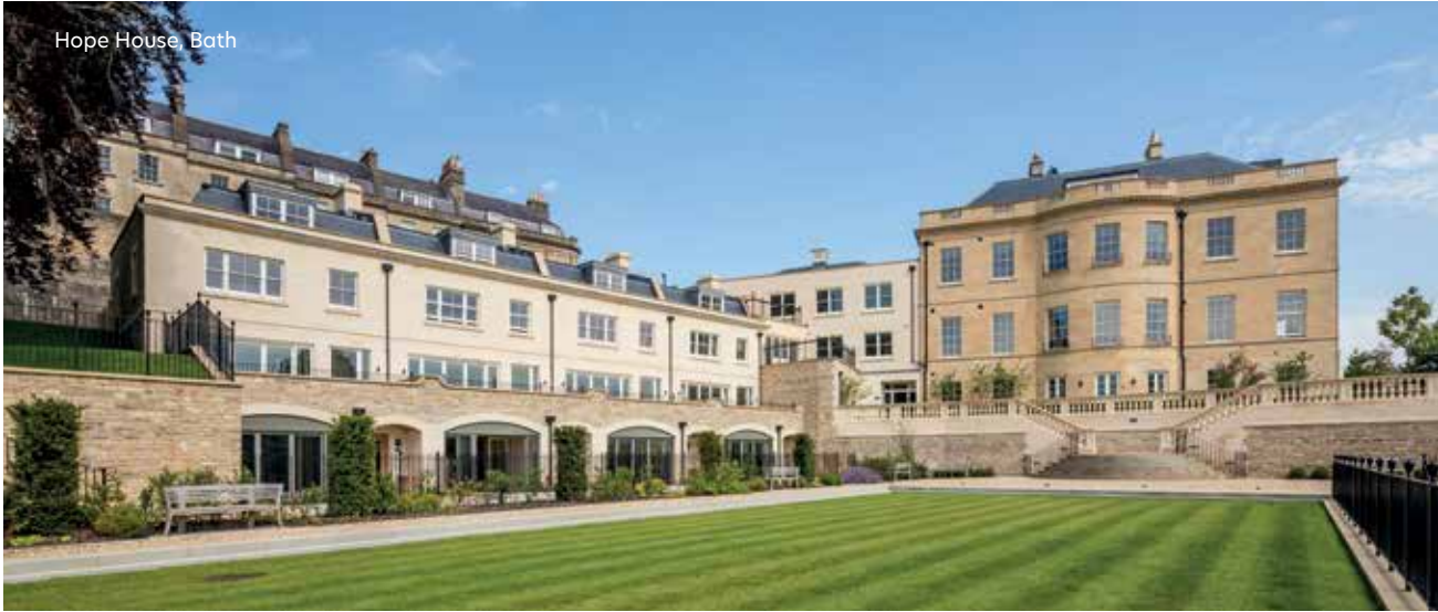
Hope House, Bath

Acorn Property Group's passion is to create positive change to meet the needs of our communities through innovative regeneration and exciting new architecture. Designing buildings and spaces where people want to live, work and spend time. Whether an urban apartment, rural retreat, coastal or riverside residence, new build or conversion within an existing