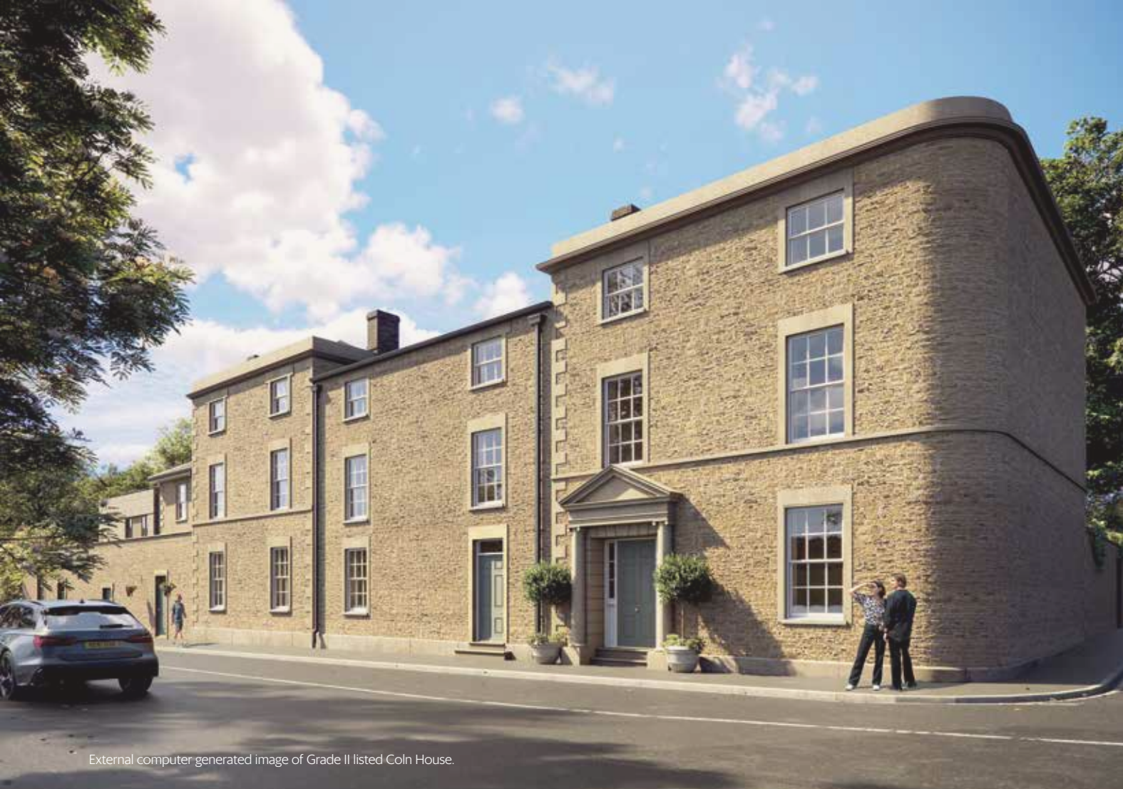
External computer generated image of Grade II listed Coln House.