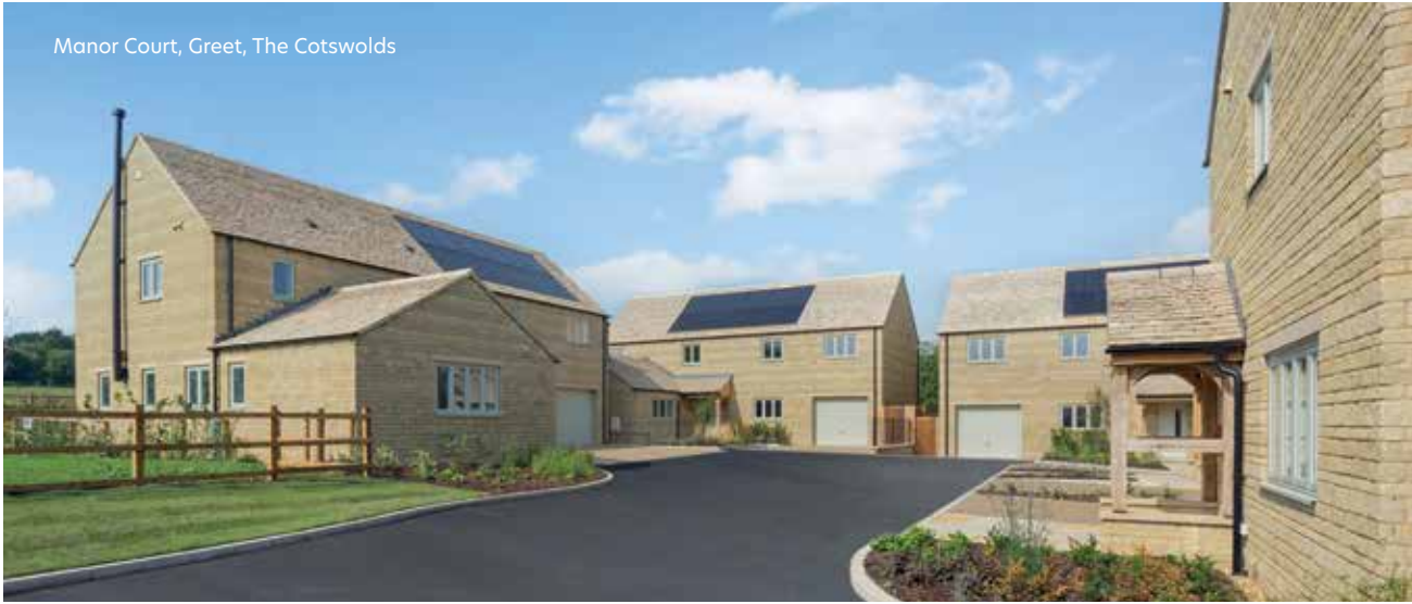
Manor Court, Greet, The Cotswolds