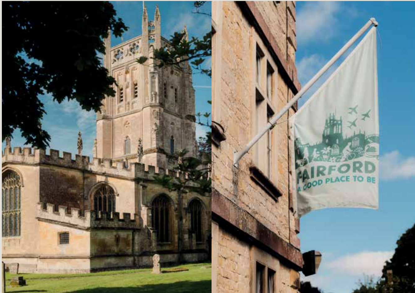
St Mary's Church Fairford

Living at Fairford Green places you in the perfect location to discover Gloucestershire's spectacular natural sights, with Lechlade-on-Thames, Cirencester, and Cotswold Water Park all nearby.