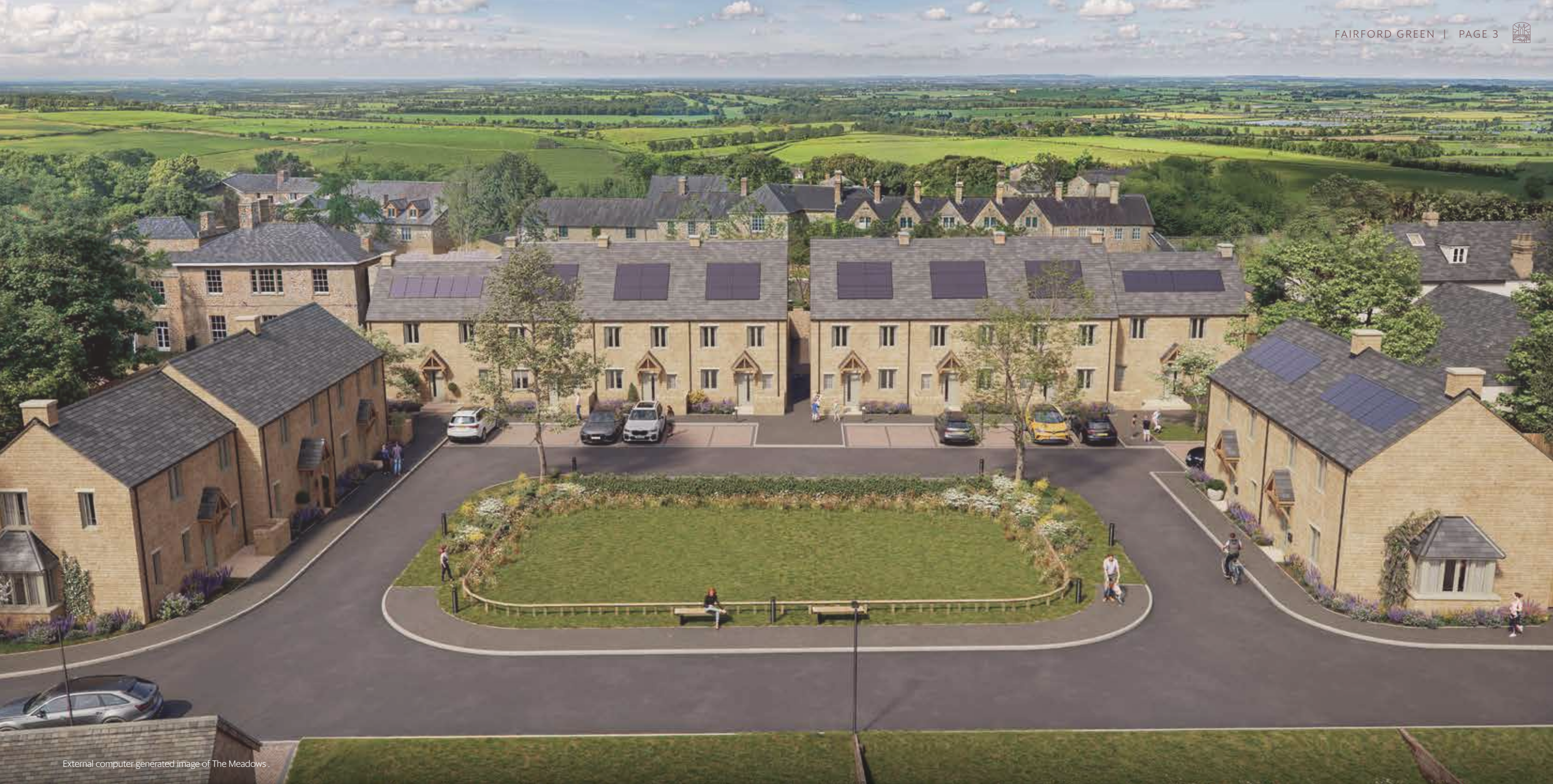
External computer generated image of The Meadows.