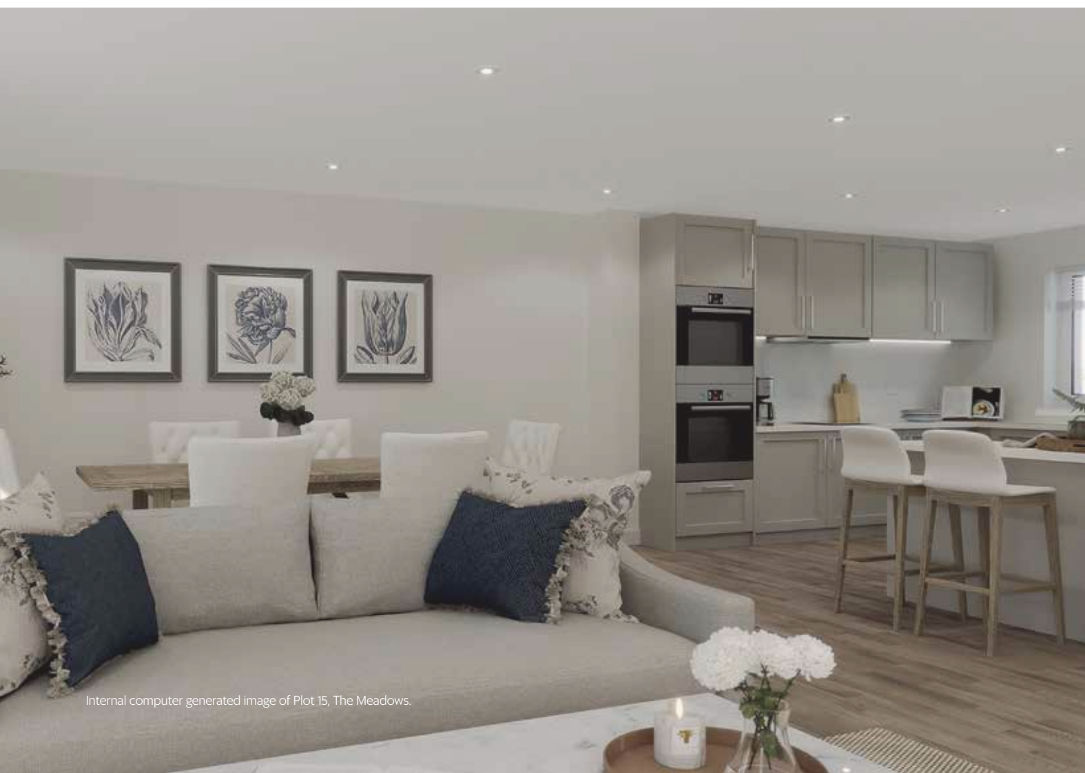
Internal computer generated image of Plot 15, The Meadows.