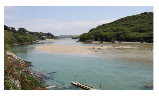
Images: 1. Fistral Beach, 2. Newquay Harbour 3. Rick Stein Fistral 4. River Gannel Estuary