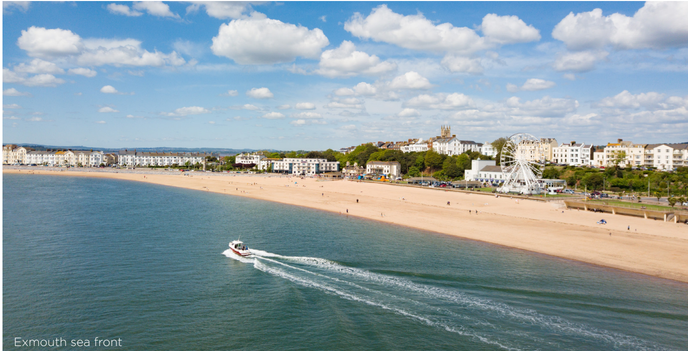
Exmouth sea front