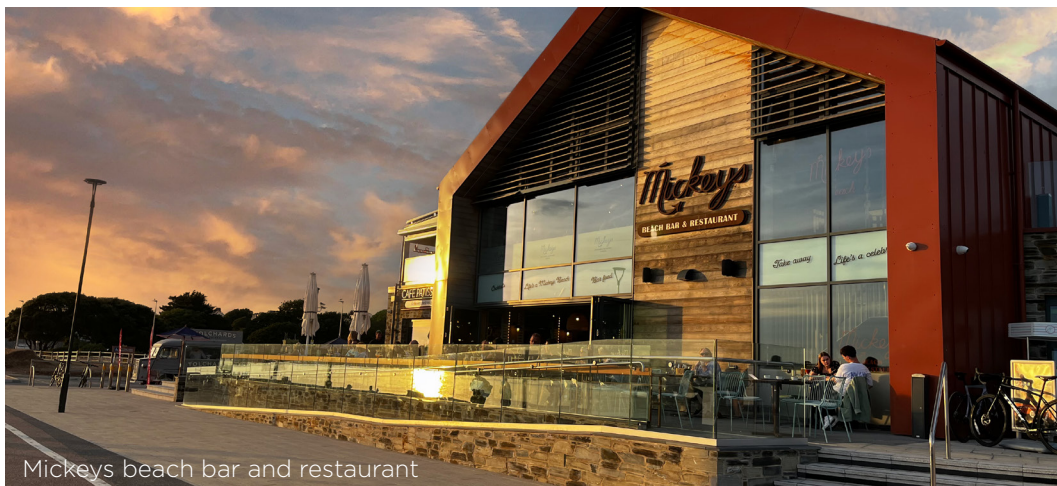
Mickey's beach bar and restaurant