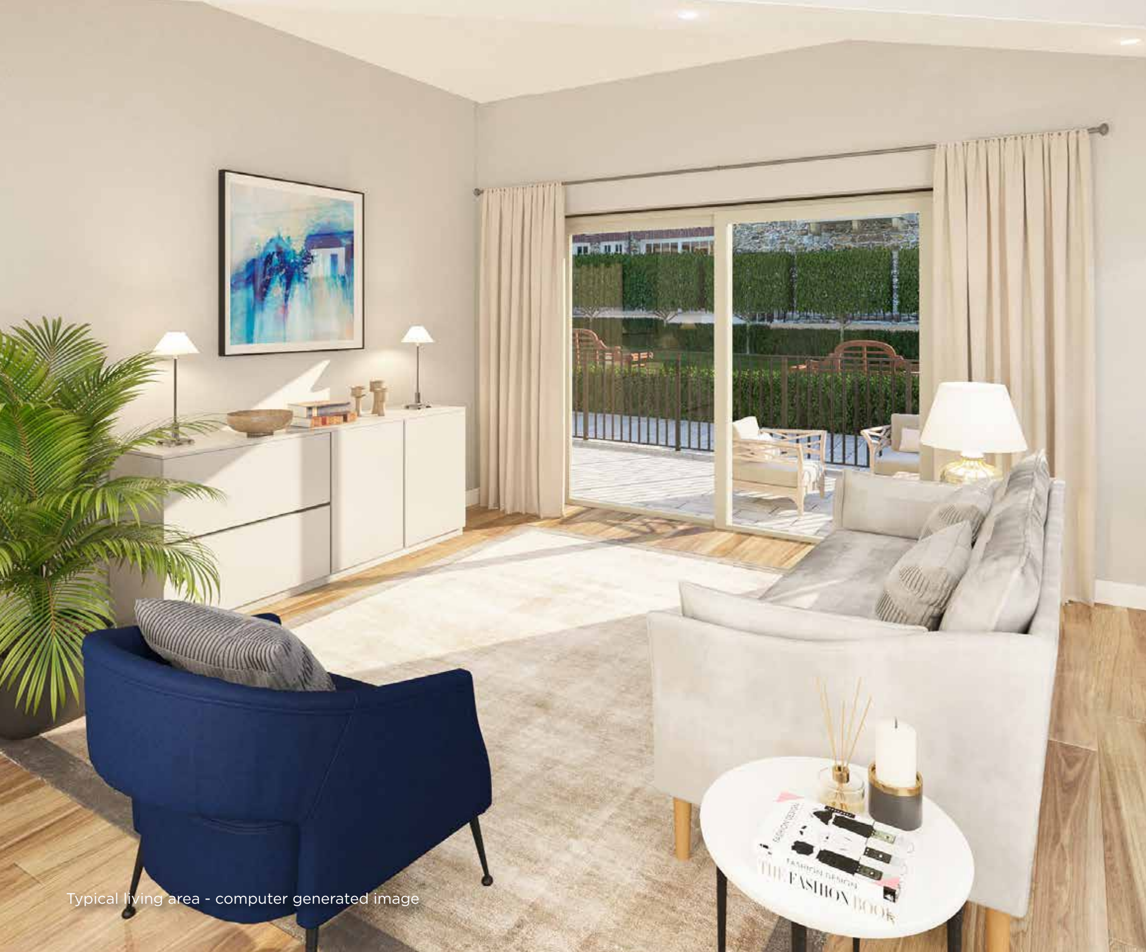
Typical living area - computer generated image