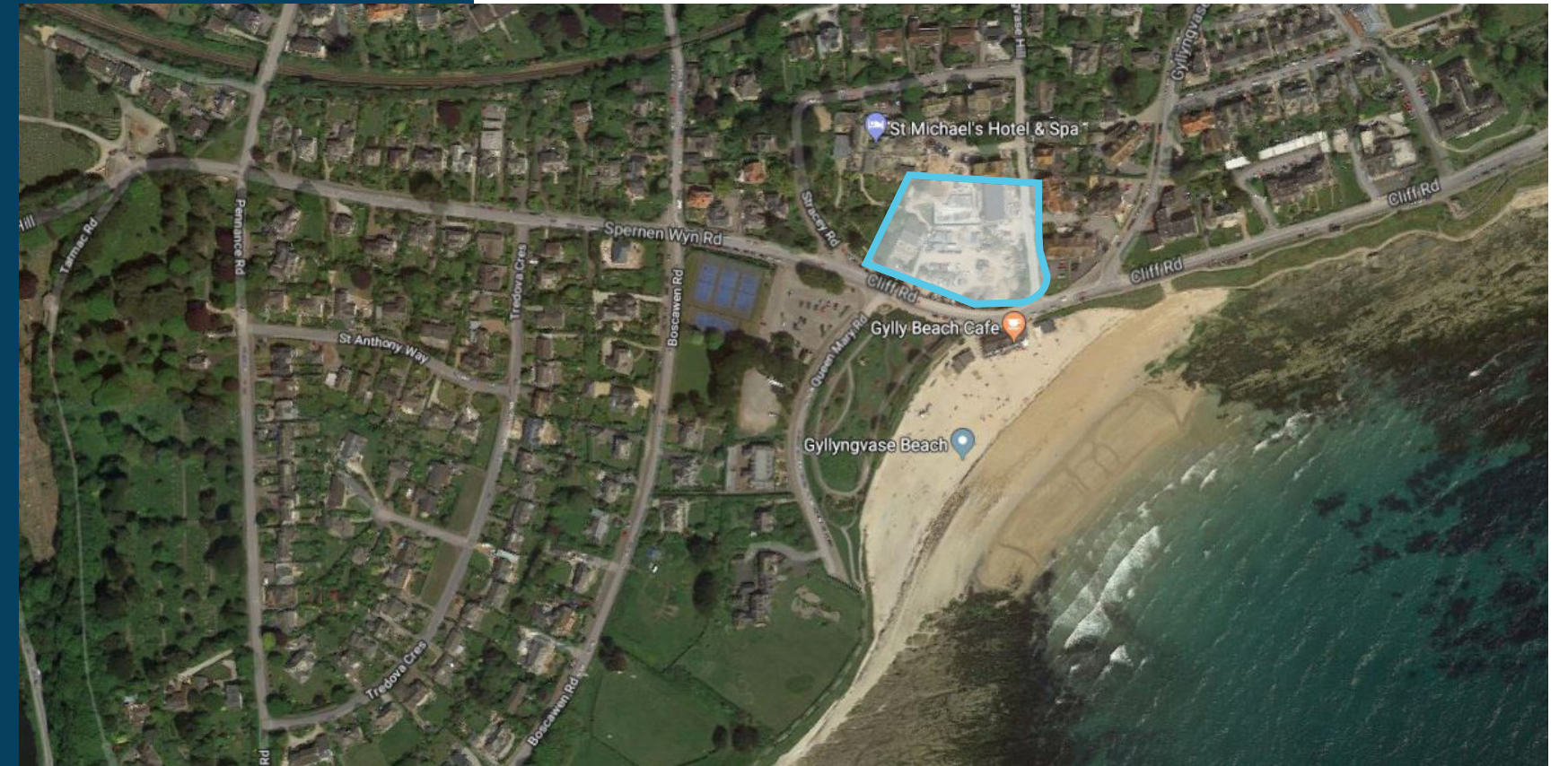
Satellite view of Gyllyngvase Beach showing development area