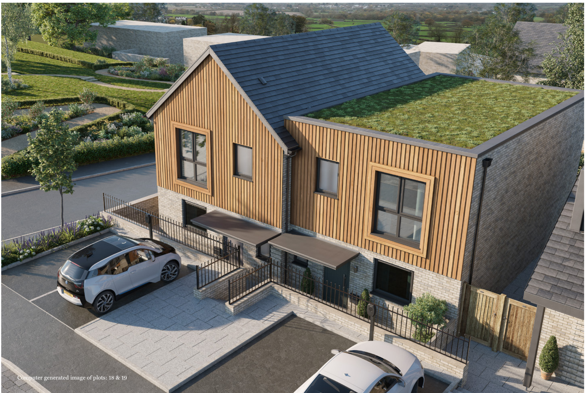
Computer generated image of plots: 18 & 19